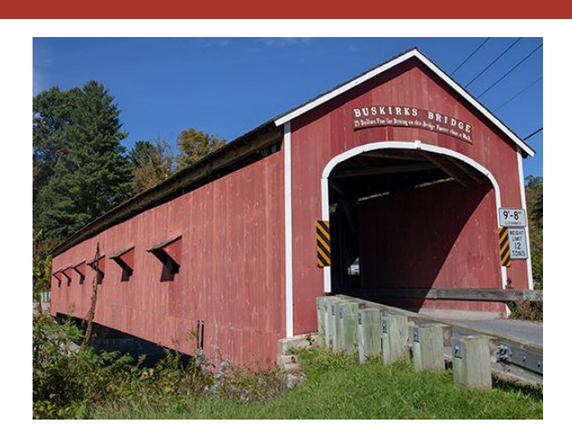
Buskirk Covered Bridge

Want a picturesque, quarantine-friendly drive to some of the most photo-friendly marvels of the Capital Region? Roll down your windows and head out to Washington County, where five covered bridges await you.