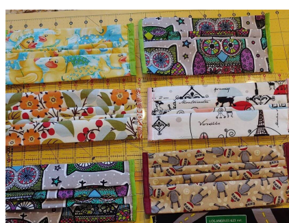
From The Troy Record Local Theater & Quilters Come Together to Make Face Masks