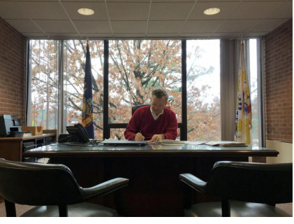
From The New Yorker Keeping Calm in Guilderland, NY