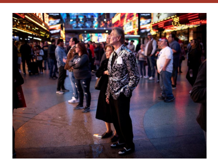
From Brookings Albany Named One of Five Economically Safest Places in COVID Crisis