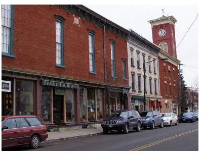
From Choose Columbia Columbia County Grant Fund Accepting Applications through 4/15