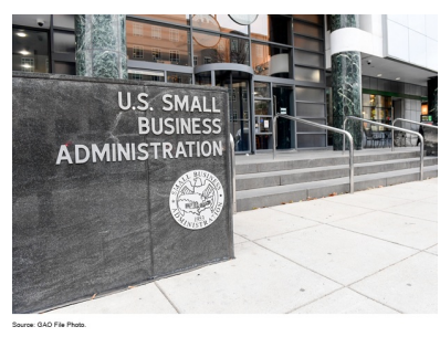
From U.S. SBA SBA Loans for Performing Arts and Theatrical Venues