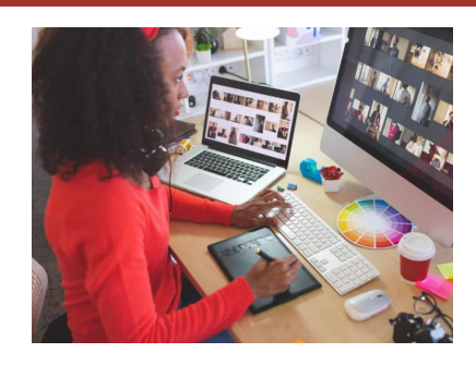
From The Guardian Why Arts & Humanities Degrees Are Making a Comeback