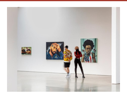
From New York Times Gallery Features Only Artists of Color