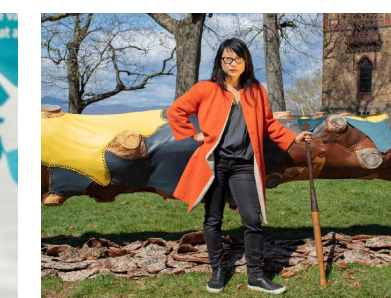
From New York Times <u>NYC Creates $25 Million</u> <u>Program to Put Artists</u> <u>Back to Work</u>