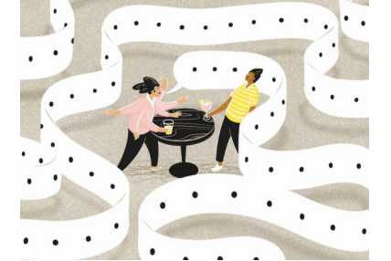
From Washington Post It's Not Just You. We Are All Socially Awkward Now.

From Freelancer's Union <u>5 Spreadsheets That</u> <u>Will Streamline Your</u> <u>Freelance Business</u>